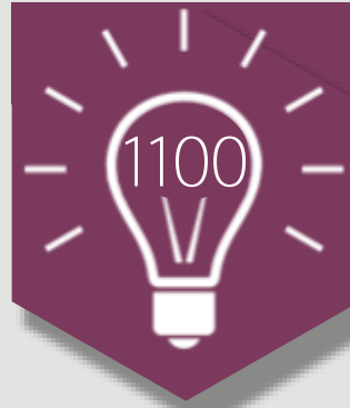
Fellows across WA State